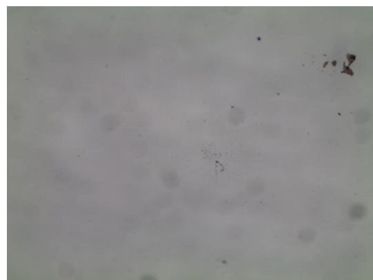
SFH-1173 with 9H Pencil Test